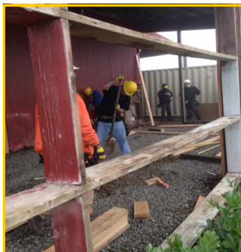
NCCT constructing the greenhouse in February

Please note that Farm To Mouth has eggs for sale and CSA vegetable/fruit baskets will be going on sale soon! Contact us for more information.